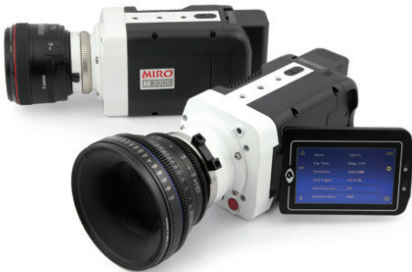
Phantom Miro LC320S with PL Mount (front) and Miro M320S with EOS Mount (rear)

For the most current version visit www.visionresearch.com Subject to change Rev August 2014