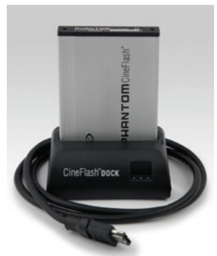
Phantom CineFlash Drive & CineFlash Dock