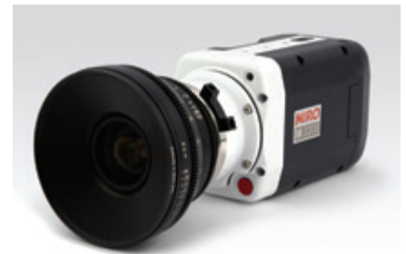
Phantom Miro M320S

Our Ultra High-Speed camera line is supported by Vision Research's Global Service and Support network offering AMECare Performance Services from multiple sites around the globe. Maximize the value of your Phantom camera by learning more about our service and support options at www.visionresearch.com/Service--Support/