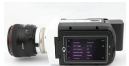
Phantom Miro LC320S with Canon EOS Mount

Just select the one you want with a tap on the screen.